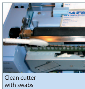
Clean cutter with swabs