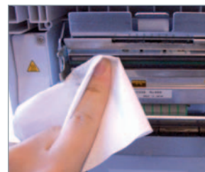
Clean printhead with tissues