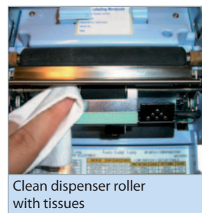
Clean dispenser roller with tissues