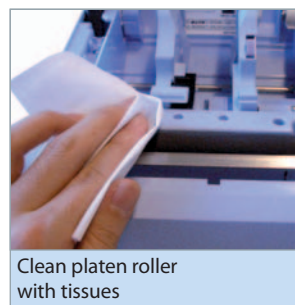
Clean platen roller with tissues